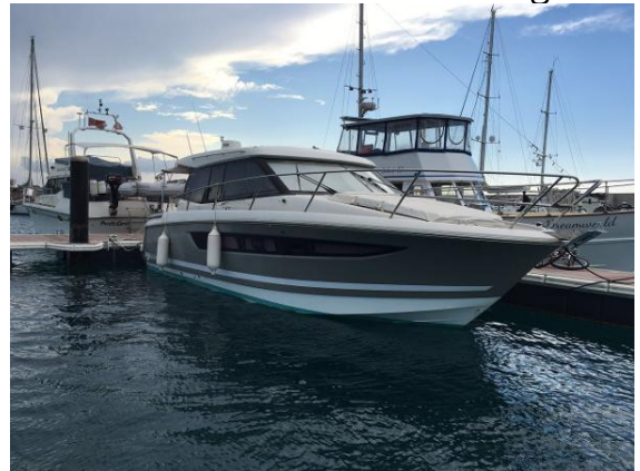
Great Comfort at Cyprus Marina