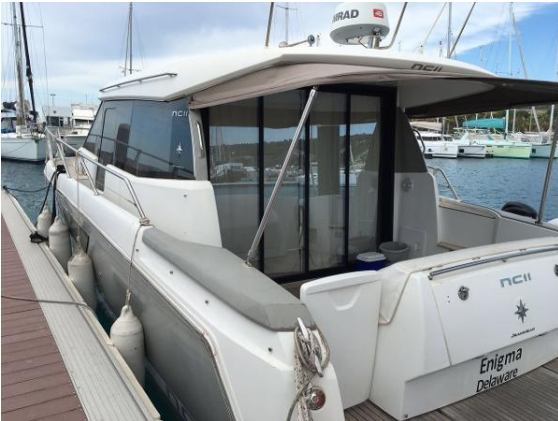
Aft cockpit with extended bimini