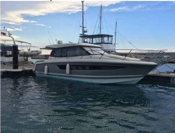
STBD side view