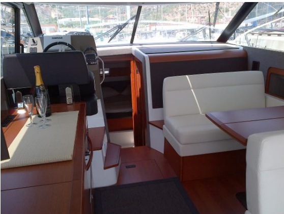
Saloon fwd view