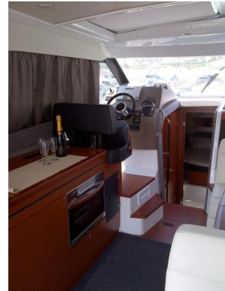
Driving Helm with port side door