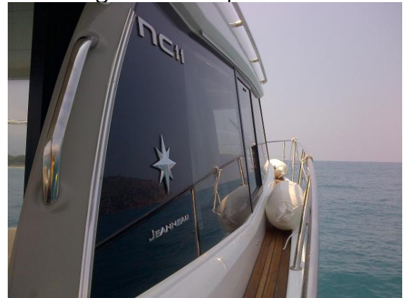
New Concept NC 11